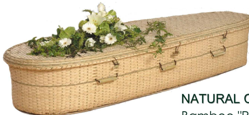
NATURAL CHOICE™ Bamboo "Passage"