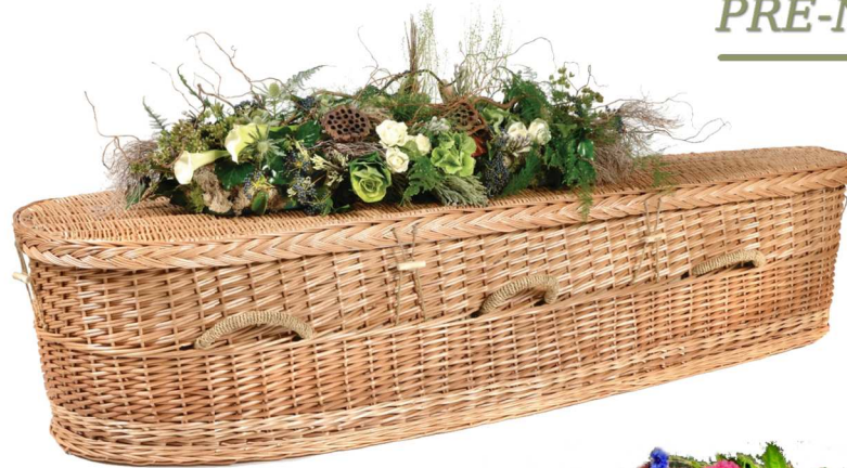
NATURAL CHOICE™ Willow "Passage"