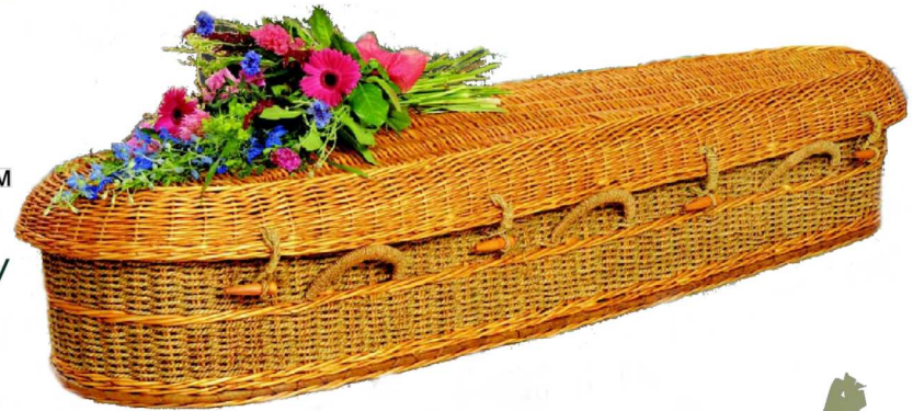
NATURAL CHOICE™ Seagrass and Willow "Passage"